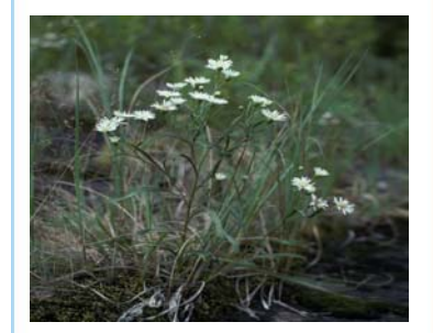
Prairie Aster (1)